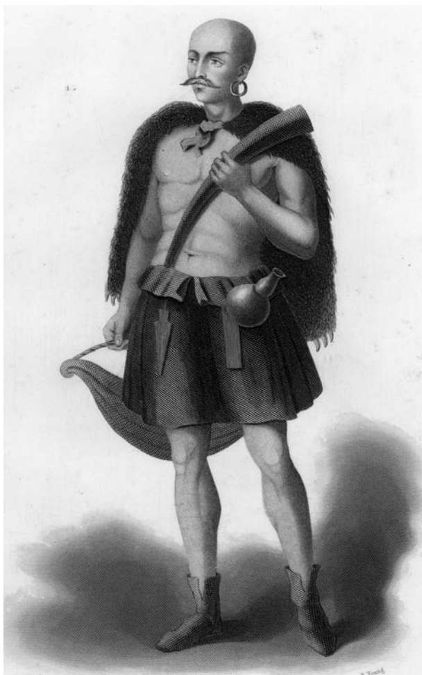
Figure 1 Indian Muslim faqir of the qalandar sect, c. 1830.

the famous stories that we have recounted, stories which as part of their religious heritage helped shape expectations of their relationship with their own holy men. Aside from the oral channels in which these narratives circulated, they continued to flourish in the colonial era through their presence in popular Urdu works from Hyderabad. In the mid-nineteenth and early twentieth century, for example, the story of Nizām al-Mulk's supernatural victory in the battle of Shakar Kera was recounted in the famous Mishkāt al-Nabuwwa of the Hyderabadī Sufi Ghulām ‘Alī